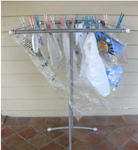
Washed plastic trash drying on the line.

One of the biggest inconveniences about keeping plastic trash is the need to wash it. Any bag or bottle or box that has contained food must be washed thoroughly to avoid bacterial growth. During the course of the Midden experiment we did a weekly wash of our plastic, which we hung on a clothesline to dry. There's nothing like having to wash rubbish to make you think twice about what you bring home from the supermarket.