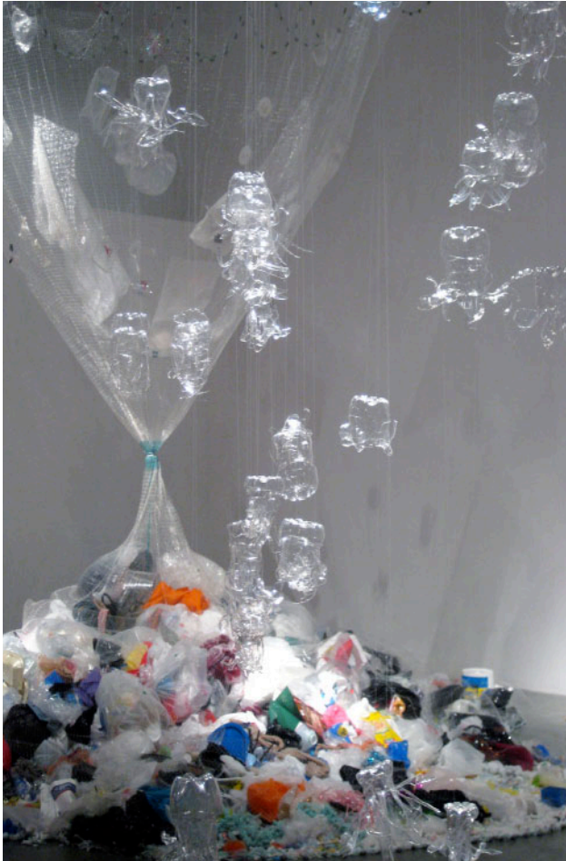
The Institute For Figuring plastic trash "Midden" 2011.