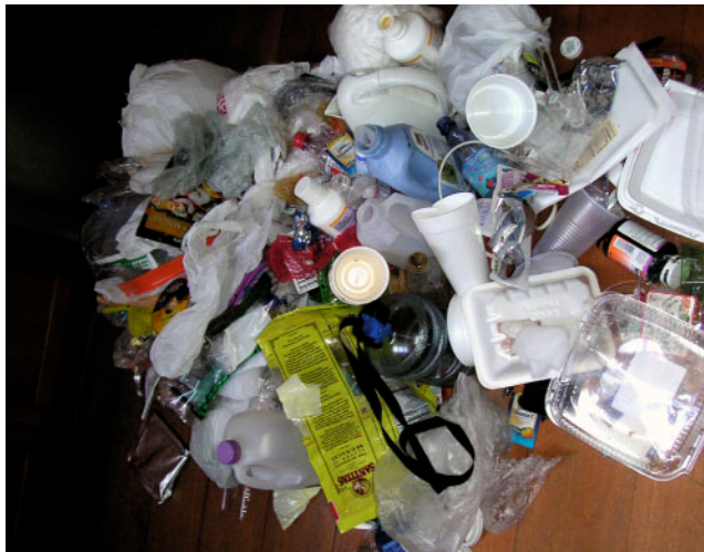
The first month of domestic plastic trash collected in the Wertheim household, February, 2007.

Contained in the Midden is almost every piece of plastic the Wertheims used in the course of their daily home life including plastic bags and wrappings, food containers, cleaning product containers, drink bottles, pill bottles, shampoo bottles, packaging, printer cartridges, outmoded connection cables, shipping peanuts, old shower curtains, and so on. In spite of its scale, this Midden represents a fraction of what the average Western citizen uses, for during the collection period the sisters worked hard to minimize their intake.